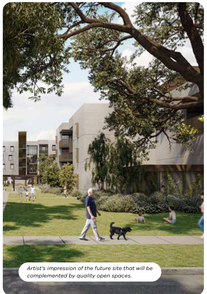
Artist's impression of the future site that will be complemented by quality open spaces.