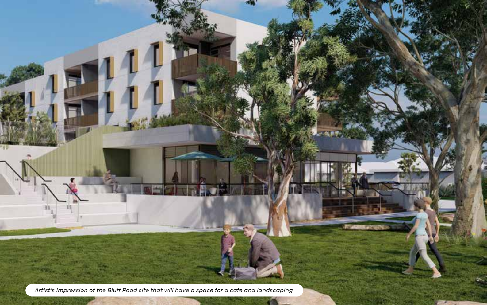
Artist's impression of the Bluff Road site that will have a space for a cafe and landscaping.