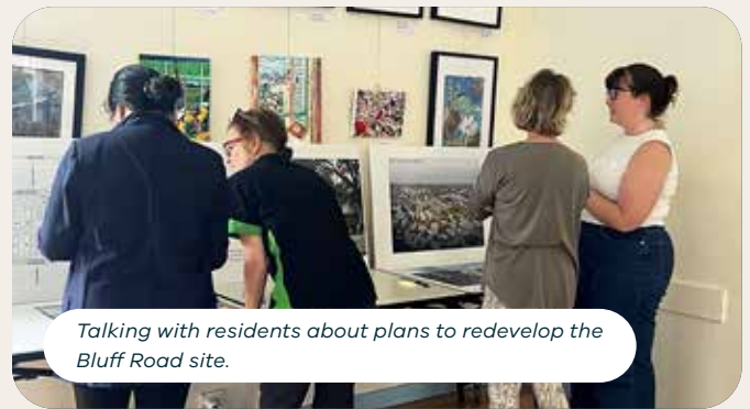
Talking with residents about plans to redevelop the Bluff Road site.