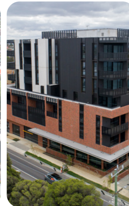
Oakover Road, Preston