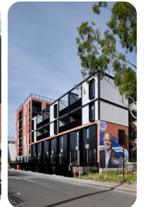
Bangs Street, Prahran