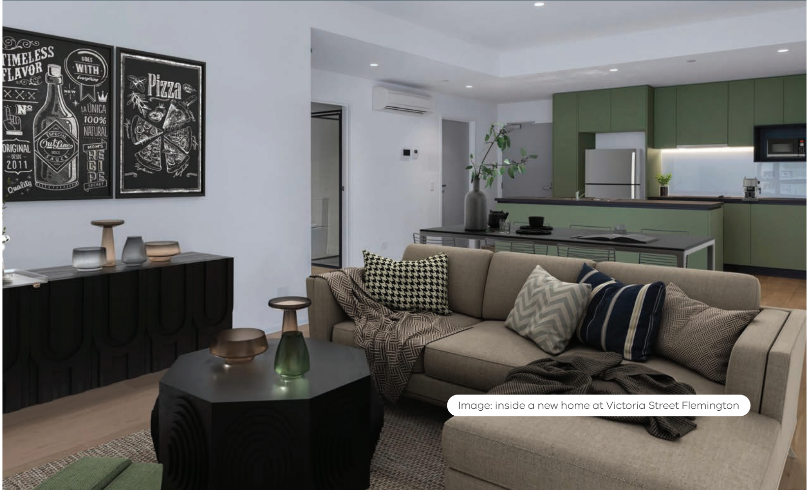
Image: inside a new home at Victoria Street Flemington