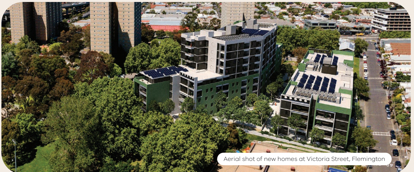
Aerial shot of new homes at Victoria Street, Flemington